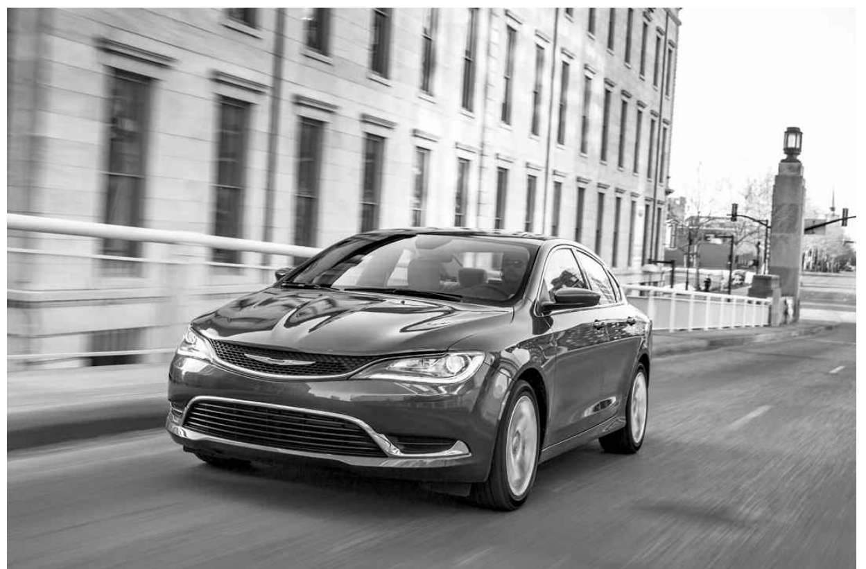
The 2016 Chrysler 200 is the mid-size sedan for customers who have earned a little luxury in their life, but demand value for their money.