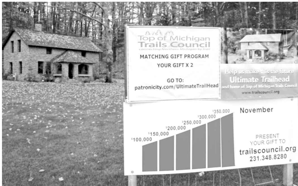
Just a whisker away. The purchase of this amazing stone building as the, "Ultimate Trailhead" for the Top of Michigan Trails Council headquarters is very close to becoming a reality.

The Little Traverse Wheelway is a 26-mile trail that hosts hundreds of thousands of bikers, hikers, runners, and in-line skaters each year. My favorite section to bike is the North Western State Trail that starts at Spring Lake Park on M-119 and travels about 8 miles into Alanson. This journey passes Round and Crooked Lakes, the Oden Fish Hatchery that offers an informative stop, several artesian wells to fill your water bottle, and ends at the Dairy Queen in